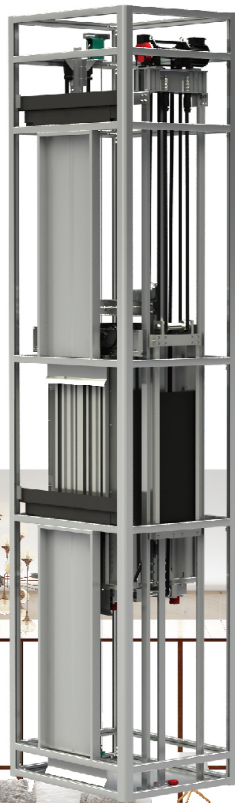
Special-purpose steel band and protection device

It puts out second generation elevator which is significant to traditional vertical elevator. It firstly applies the more energy-saving, environment-protection and durable composite steel band in the world. It matches with multiple leading international technologies such as effective energy-saving host, variable frequency door machine, safe and reliable light curtain door protection device etc. It brings the development of vertical transport elevator to a new stage.